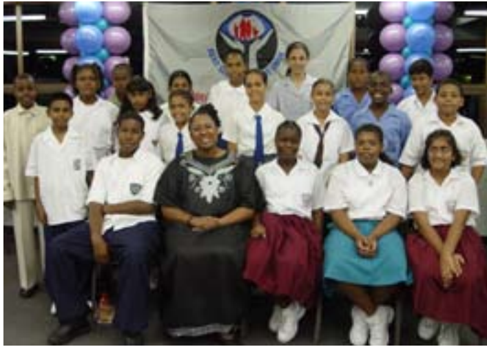
2004 SEA STUDENTS WITH GUEST SPEAKER