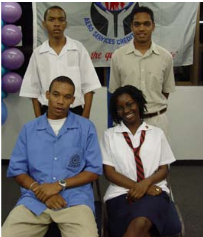
2004 HEI AWARDEES